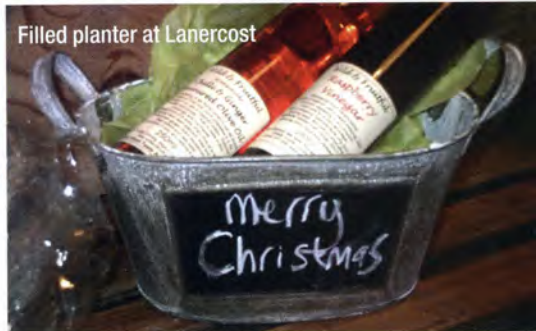
Filled planter at Lanercost