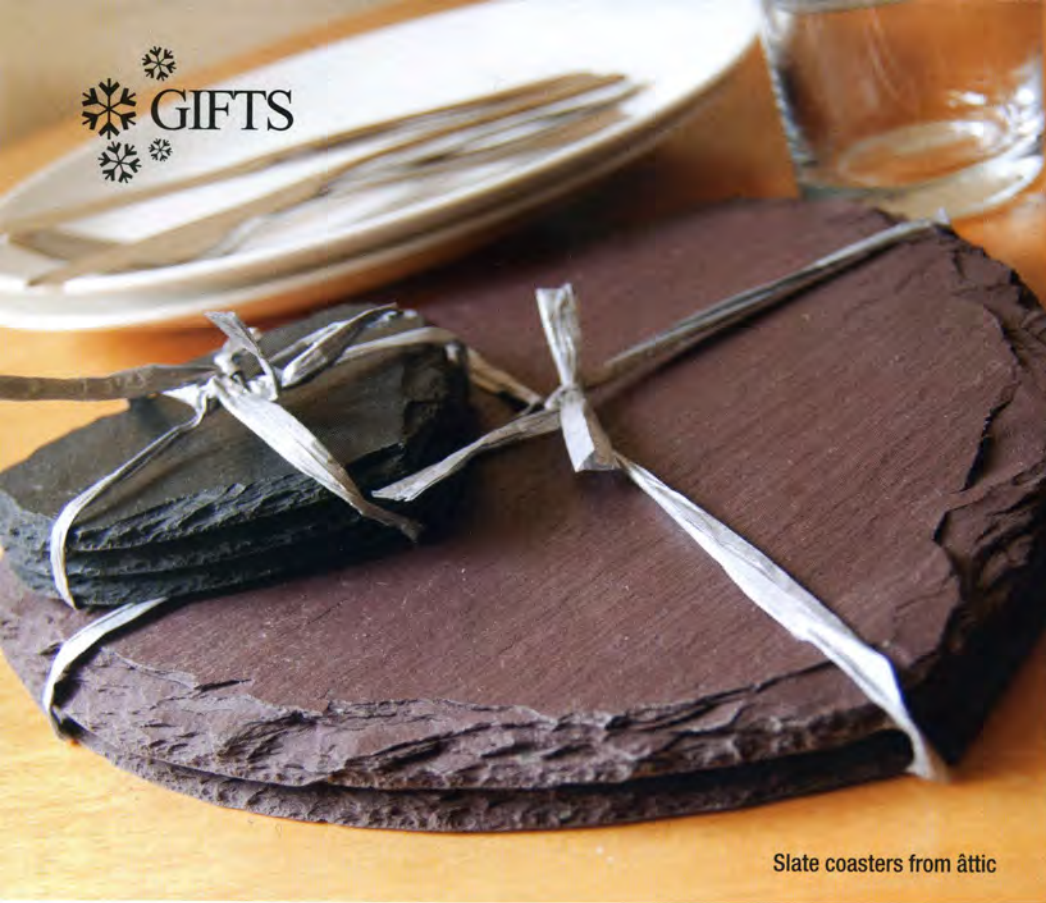
Slate coasters from âttic