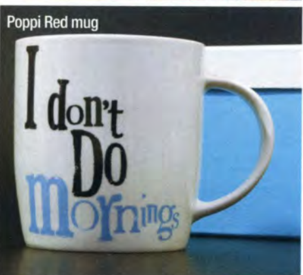
Poppi Red mug

produces striking hand-embroidered cards, advert calendars and wall-hangings using lace, beads and ribbons. She says: "People love the build-up to Christmas and are looking for very personal gifts. They appreciate the individuality of our work."