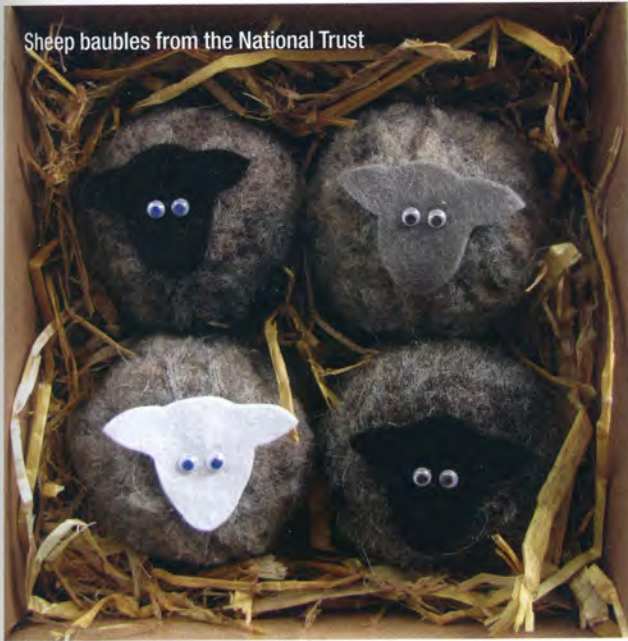
Sheep baubles from the National Trust